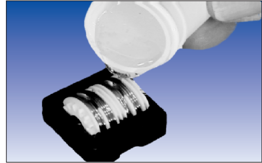
4460 Fully Impregnates a High Temperature Coil