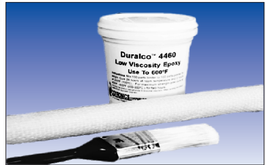
4460 Coats, Moisture Proofs, Seals and Protects Ceramic Sleaving